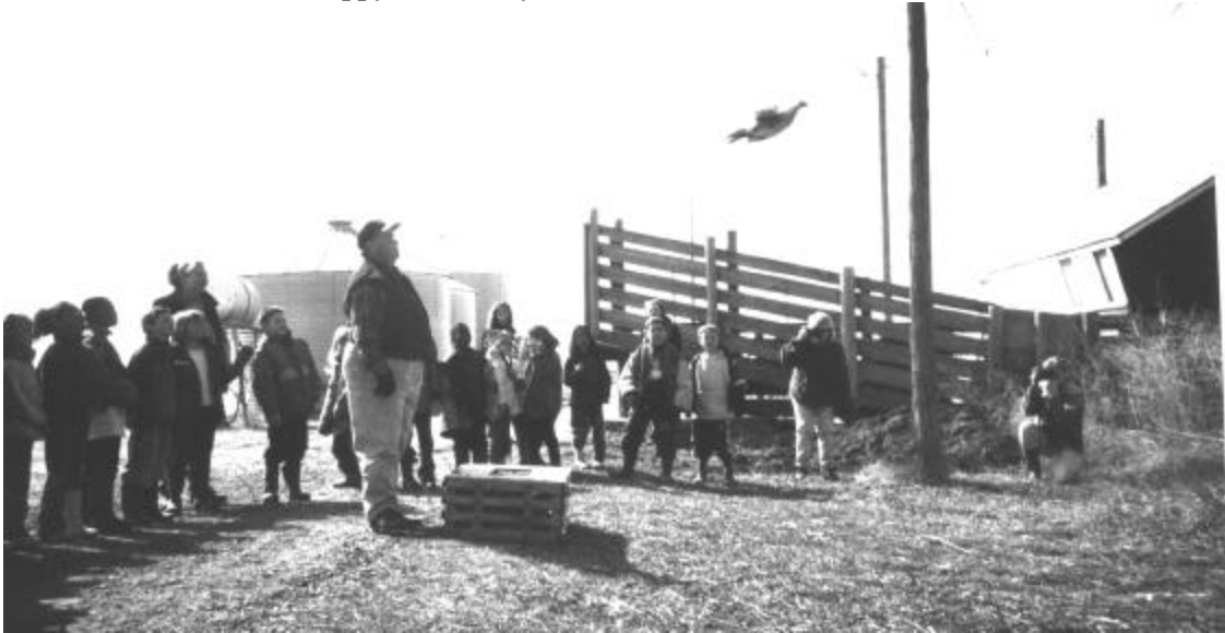
Spring Pheasant Release With Audience of School Children